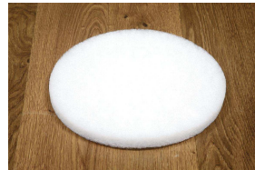
Cleaning Pad white (Ø 33 cm)