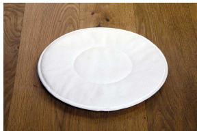
Micro-fibre pad (Ø 33 cm)