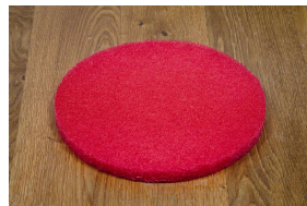
Cleaning Pad red (Ø 33 cm)